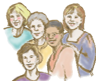
Women of the Church